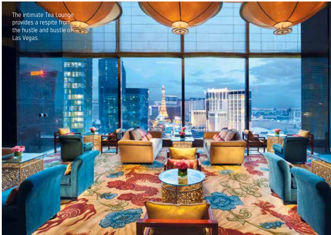
The intimate Tea Lounge provides a respite from the hustle and bustle of Las Vegas.