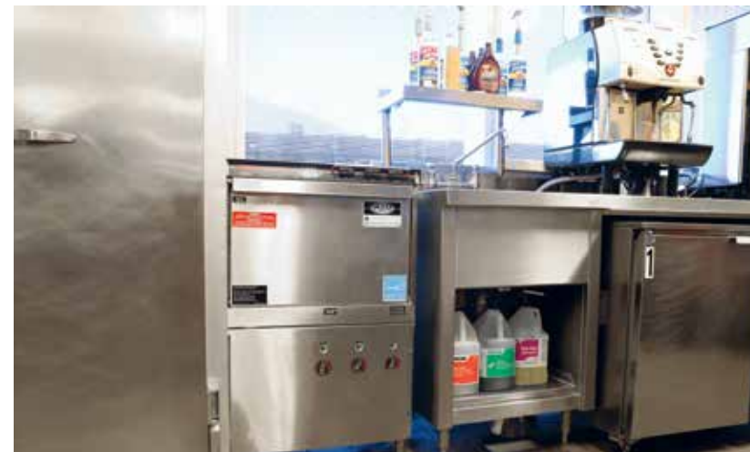
(Right and below) The CMA Dishmachines GL-X Chemical Sanitizing Glasswasher hard at work at Mandarin Oriental.