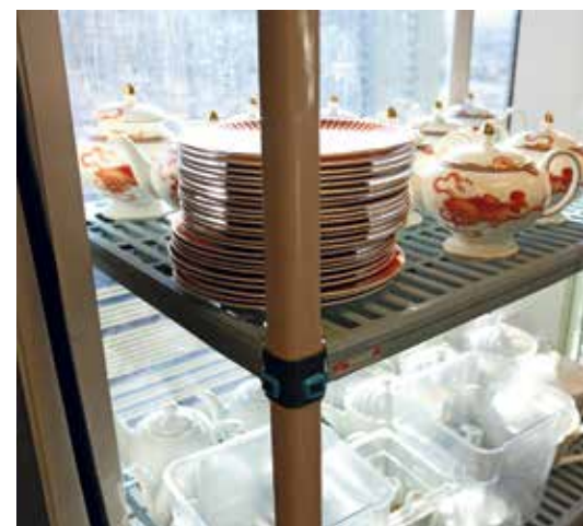
(Above) Sturdy Super Erecta Shelving helps keep the hotel's kitchen organized.