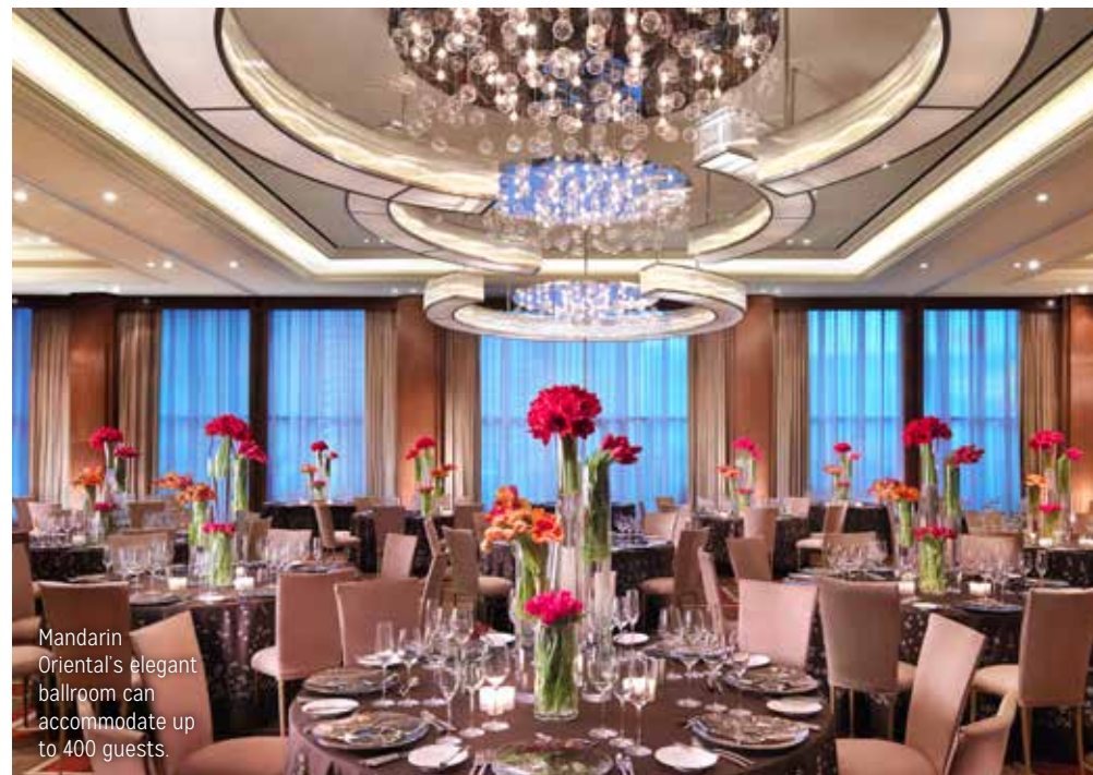
Mandarin Oriental's elegant ballroom can accommodate up to 400 guests.

The fact that the hotel operates multiple concepts under one roof represents another way this operator segment differs significantly from traditional restaurants. Where an average restaurant has only one concept, "in a hotel you can have many different concepts of restaurants, and you have to be able to switch between one and the other," Chef Werly says. "It's going to take a different approach on the conceptualization of the menu, the way you organize yourself and the way you're going to look at resources in the kitchen."