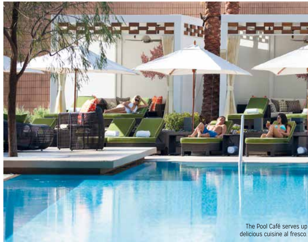
The Pool Café serves up delicious cuisine al fresco.