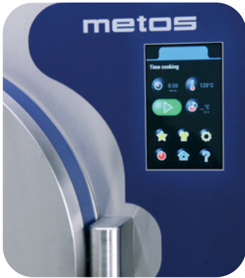
Multi-language Touch Screen interface