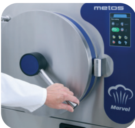
The easy grip door handle is designed for single hand operation