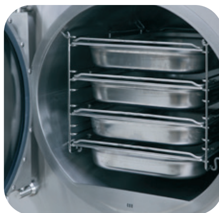
You can simultaneously make different dishes, cook 4x GN 1/1 65 mm or 3x GN 1/1 100mm pans at time.