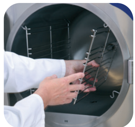
Easily removable GN guide rails help to clean the chamber. Integrated recoil handshower is an option.