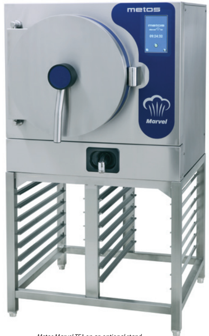
Metos Marvel TE1 on an optional stand.

With the Metos Marvel you can swiftly respond to changing demand and reduce losses. You can simultaneously make different dishes, since tastes and aromas will not transfer from one food to another.